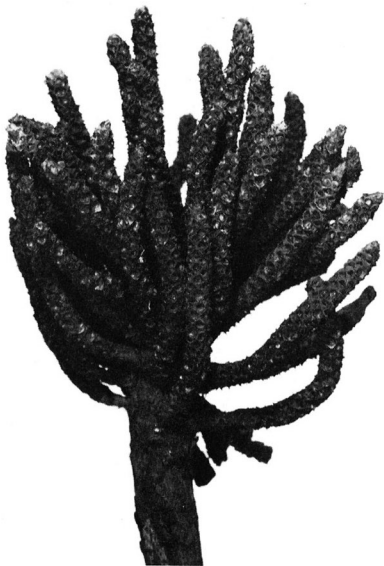
2. An old pistillate inflorescence of Marojejya darianii .

extending between the staminate flowers; floral bracteoles minute, only 1 seen. Staminate flowers borne in pairs, more or less symmetrical, ca. 3.5 \times 2.0 mm; sepals 3, free, widely separated, tongue-like, ca. 2.25 \times 1 mm, apically pointed, slightly keeled, the margins very finely serrate, 1 sepal usually slightly wider than the others; petals 3, free, valvate, more or less boat-shaped, 2.5 \times 1.5 mm; stamens 6, filaments awl-shaped, long and slender, ca. 2.0–2.5 mm long, united at the base with the pistillode, the antepetalous inserted lower than the antepetalous; anthers medifixed, ca. 2.5 \times 1 mm, latrorse, more or less exerted at anthesis; pistillodes 3, irregularly joined, ca. 0.75 mm long. Pistillate inflorescence (Fig. 2) apparently partially concealed among the leaf bases; peduncle at least 15 cm long, more or less circular in cross-section, ca. 2 cm diam.; prophyll and peduncular bracts not available; rachis ca. 6 cm long, bearing 48 closely crowded, catkinlike rachillae;