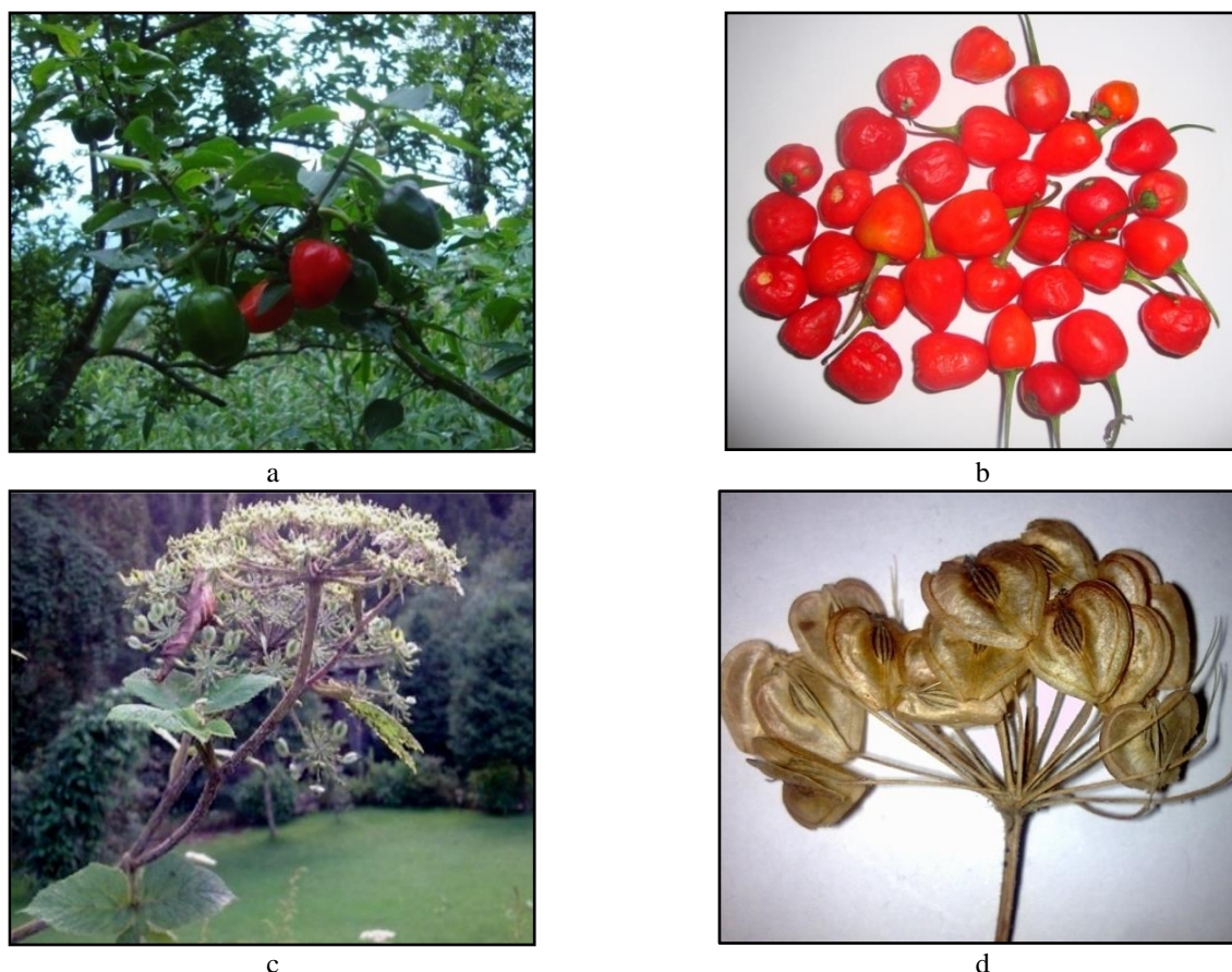
Figure 1: a. Capsicum annuum var. cerasiforme (Mill.) Irish b. Fruits of Capsicum annuum var. cerasiforme (Mill.) Irish c. Heracleum nepalense D. Don. d. Fruits of Heracleum nepalense D. Don.