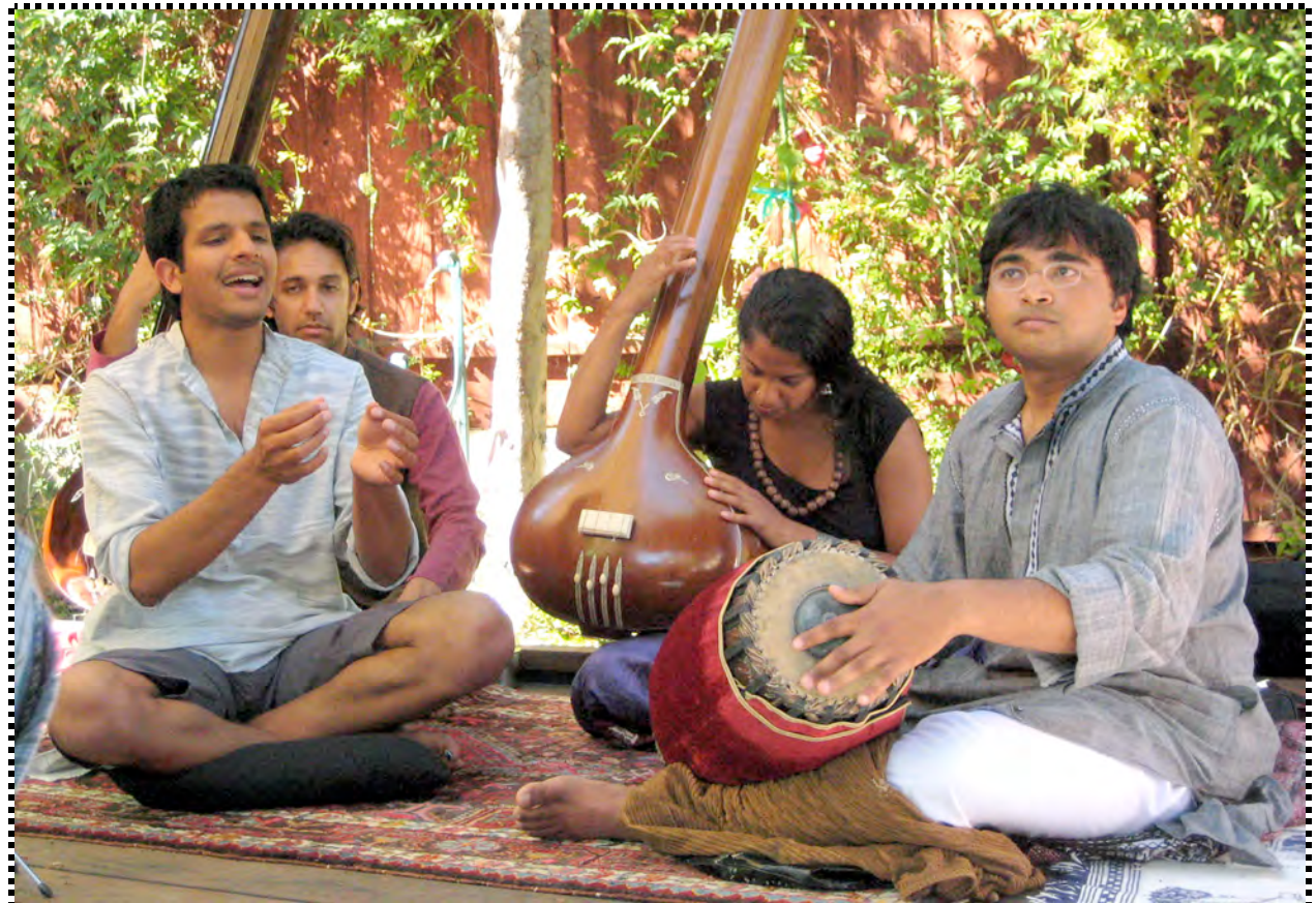
The Sangati Ensemble at a house concert.

The Sangati Center effectively tapped the interest of older generations of South Asian people in continuing cultural traditions. Their contributions supported the new work, and the series of concerts at the Center in San Francisco which primarily serves younger generations (many of South Asian descent, but some not). The music series has been a catalyst for the overall development of the Sangati Center, which in addition to music programs sponsors other community-building activities such as traditional cooking, greening programs, and neighborhood beautification.