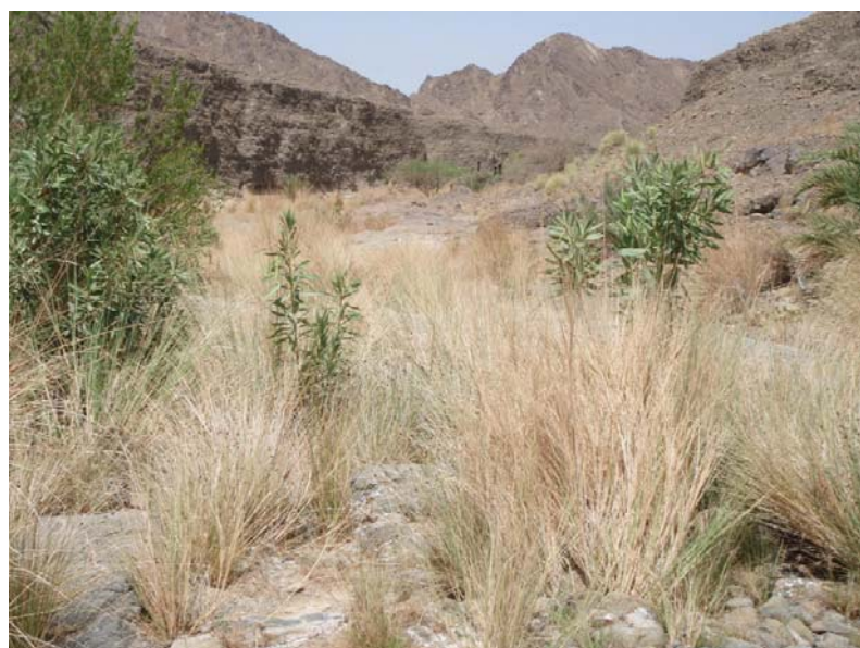
Fig 6. A large stand of dry S. kajkaiense , a somewhat unusual sight.