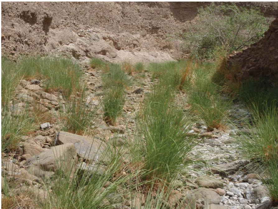
Fig 4. A monospecific stand of small Saccharum ravennae in a wadi near Hatta.