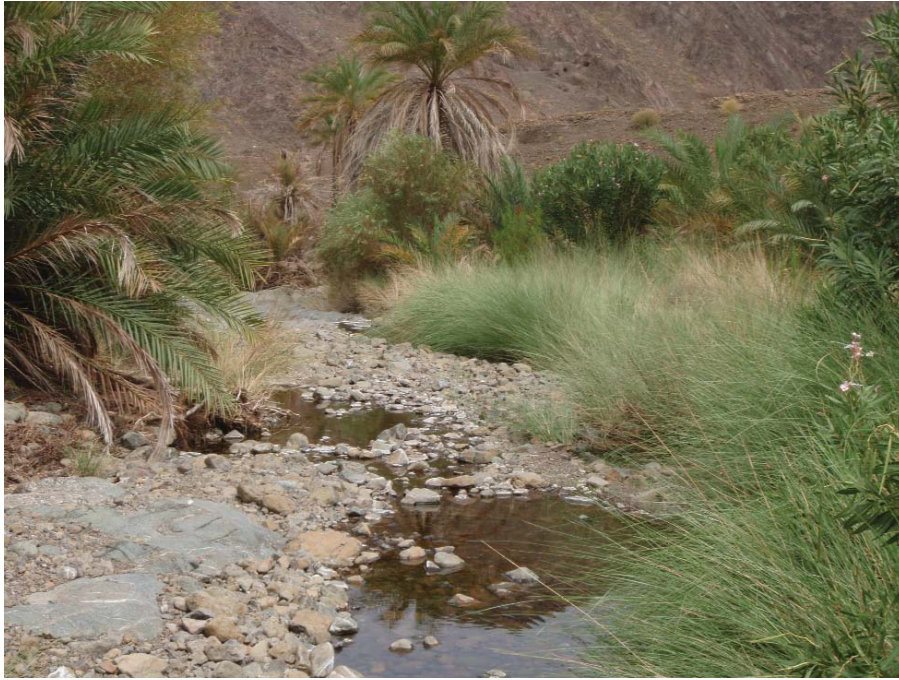
Fig 3. Abundant Saccharum kajkaiense (right) in Wadi Musah.