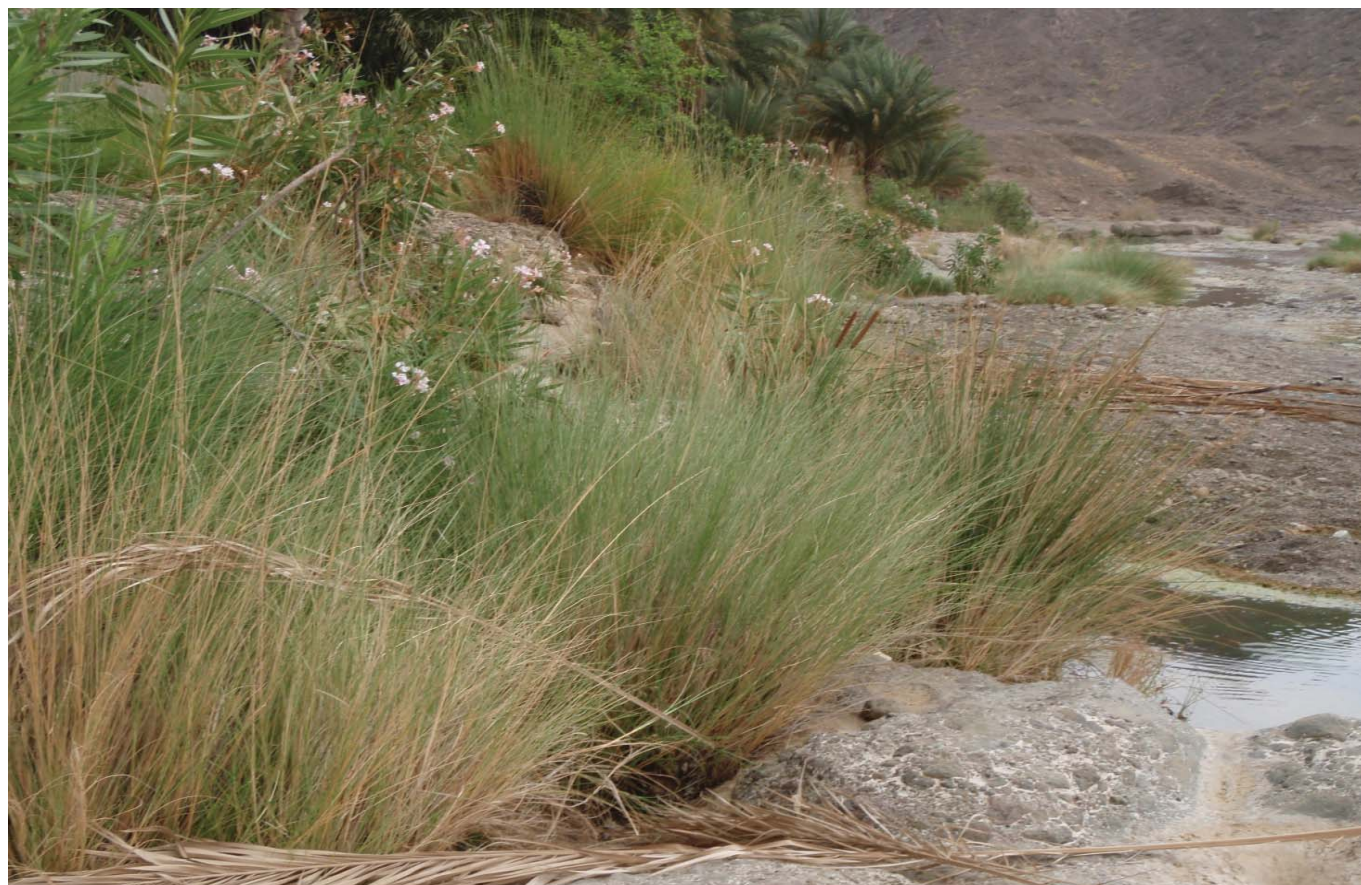
Fig 1. Saccharum kajkaiense along Wadi Khadra, showing its affinity for low ground. A clump of S. ravennae is visible at top, left of centre.

On the East Coast of the UAE, permanent water is relatively scarce except in Wadi Wurayah, which features the UAE's only year-round waterfall. There a single S. kajkaiense plant was found within the forest of Arundo donax reeds and S. ravennae above the falls. A by-product of that particular visit was the discovery of the tall, reed-like sedge Cladium mariscus , apparently a first record for the UAE. Other potential East Coast sites in Wadi Safad and Wadi Hayl did not reveal S. kajkaiense . However, it is not unreasonable to expect it to occur to the south, in some of the larger, wetter wadis of the Batinah coast of Oman.