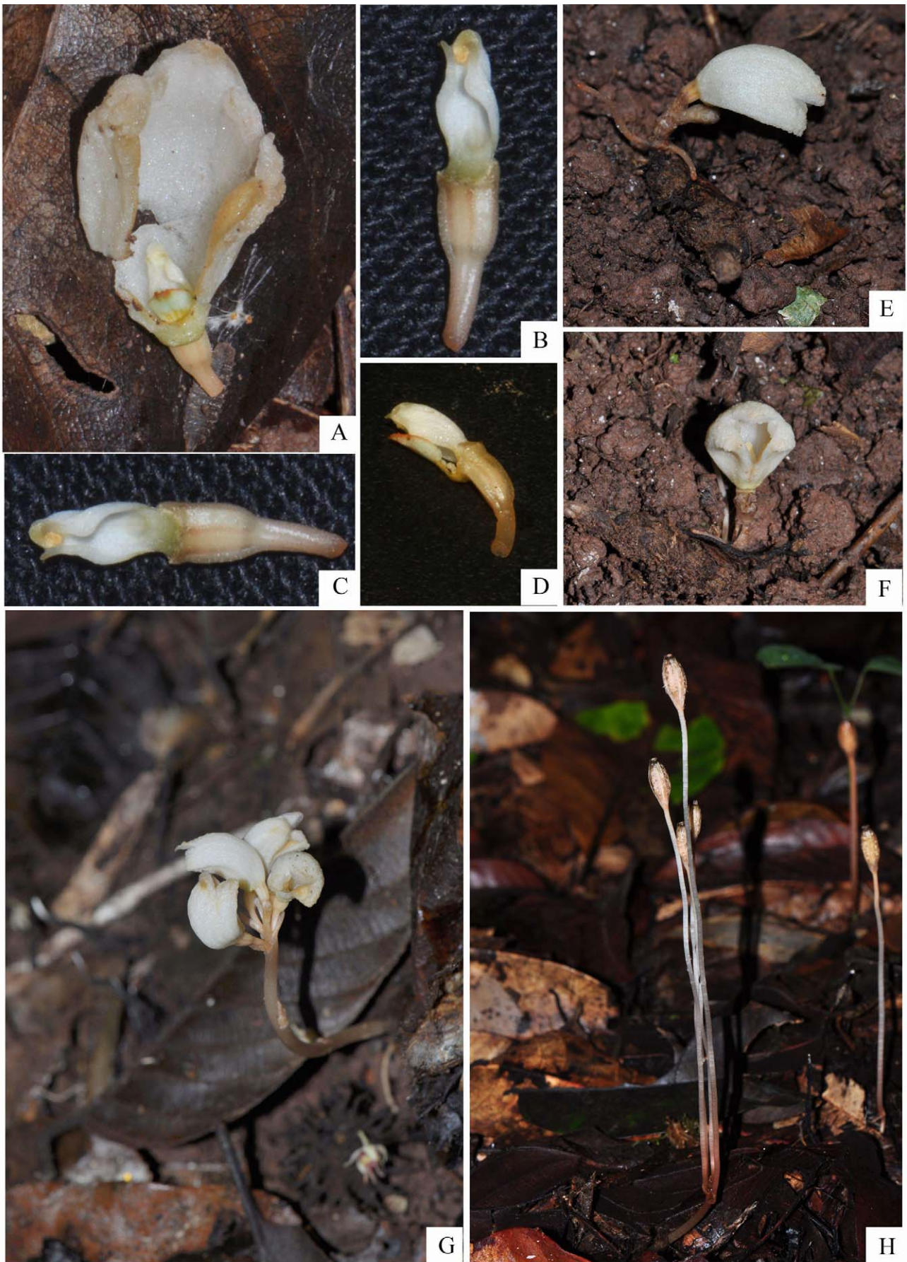
FIGURE 1. Gastrodia albidoides (from the type locality). A. Longitudinal section of flower. B, C. Column. D. Lip, column, and ovary. E–G. Flowering individual. F. Fruiting individual.