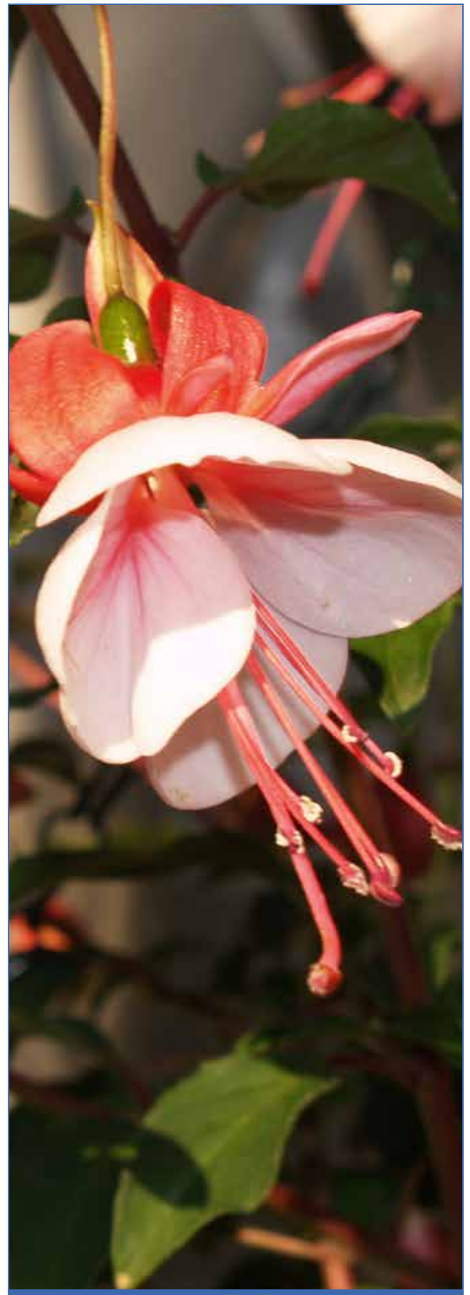
This is a single flower because it only has four petals.