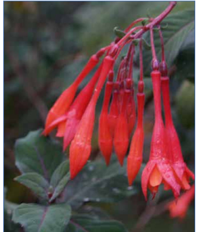
A typical F. triphylla hybrid fuchsia : long tubular flower and three leaves emerging at the same position along the length of the stem.