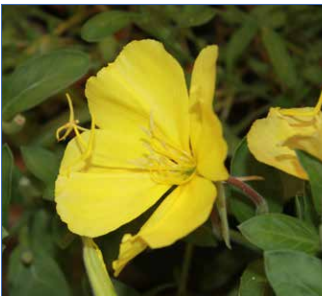
Oenothera (Evening Primrose, also belongs to the family “ Onagraceae ”

Leaves of all these genera are normally simple (not divided). Flowers commonly have four petals, stamens are normally 4 + 4, there can be one or more stigmas and the ovary is inferior. Fruits are normally a loculicidal capsule and can sometimes be a berry or nut.