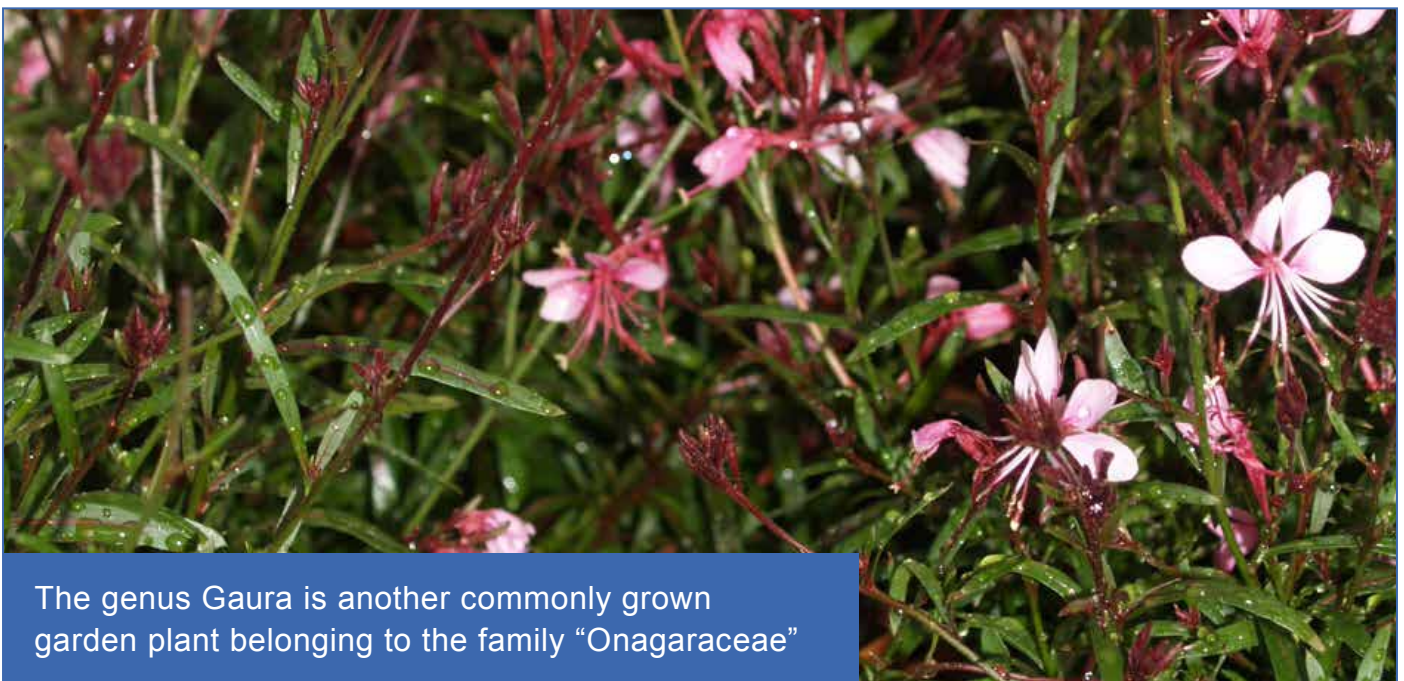
The genus Gaura is another commonly grown garden plant belonging to the family “Onagraceae”

The name fuchsia is used both as a scientific and common name in most places. Occasionally other common names have been used including “Ladies Eardrops” to refer to all fuchsias , or terms such as “Honeysuckle Fuchsia ” to refer to a particular species.