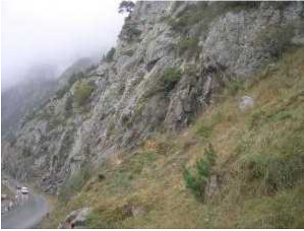
Site 19. Rock complex