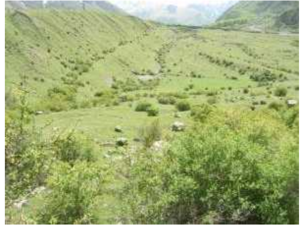
Site 5. Overgrazed grass forbs degraded meadow with shrubbery of the sea-buckthorn, barberry and juniper in the foreground