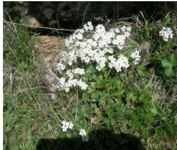
Site 12. Androsace barbata