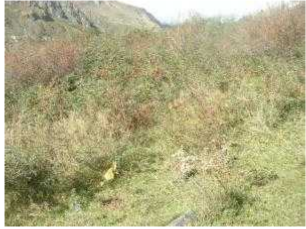
Site 6. Sea-buckthorn shrubbery ( Hippopha rhamnoides )

Site N7. GPS coordinates N42°67'78.9"/E 44°64'75.0", 1674 m a.s.l. Exposition – west. Slope inclination - 20-25°. In the degraded grass forbs meadow the sea-buckthorn scrub is growing in kind of islets (like the previous site). The habitat is of medium conservation value.