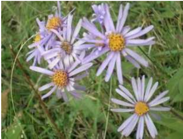
Site 17. Aster ibericus