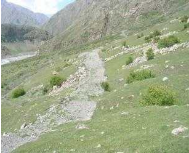
Site 12. Berberis vulgaris