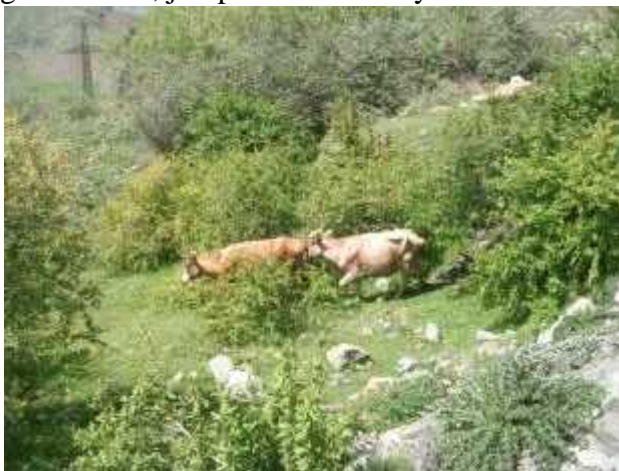
Site 13. Sea-buckthorn shrubbery with admixed goat willow, juniper and barberry

Site N14. Kazbegi District. Slope inclination-30°. Southern exposition, foliated detritus.