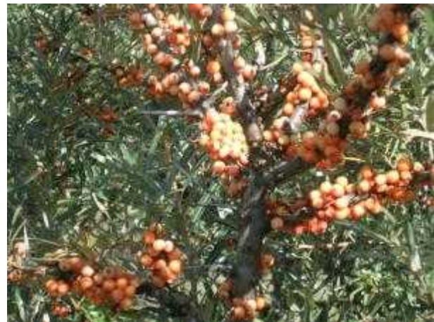
Site 3. Sea-buckthorn ( Hippophae rhamnoides )