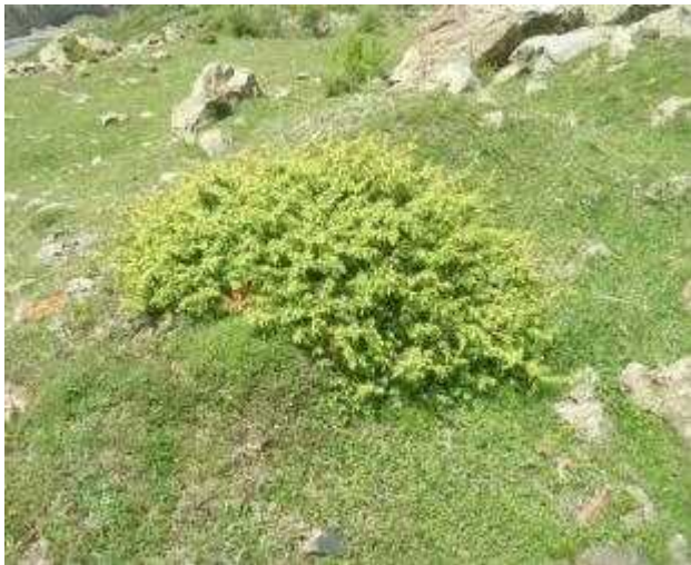
Site 12. Juniperus depressa

The site is represented by the sparse shrubbery with the following species: barberry ( Berberis vulgaris ), juniper ( Juniperus depressa ).