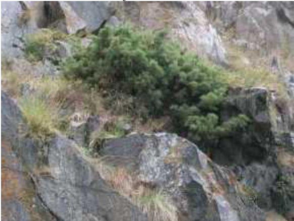
Site 19. Juniperus depressa