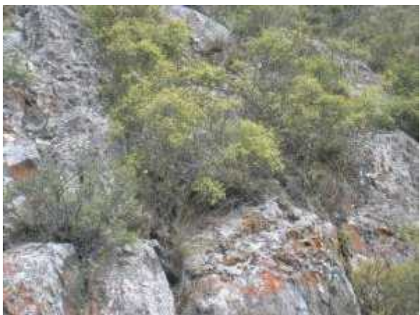
Site 16. Meadowsweet ( Spiraea hypericifolia )

Site N16. GPS coordinates N42°68'45.9''/E 44°64'47.2'', 1612 m a.s.l. Meadowsweet ( Spiraea hypericifolia ) on the rock. Slope inclination -70-80-90°, exposition – southwest. With admixed Ephedra procera . Herbaceous vegetation is represented by chasmophytes: Minuartia brotheriana , Saxifraga juniperifolia , Draba brioides . The habitat is of high conservation value.