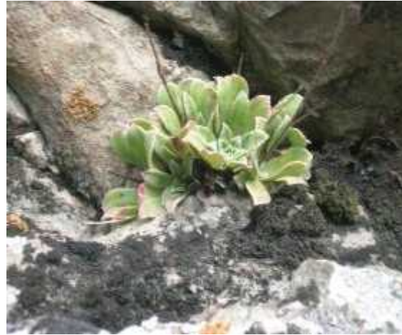
Site 15. Saxifraga cartilaginea