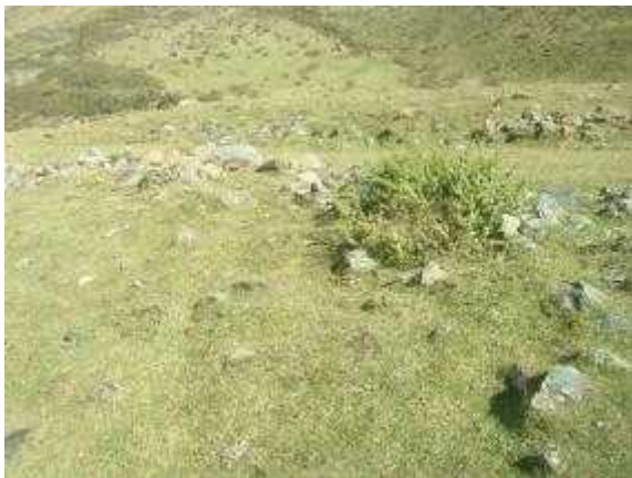
Site 2. Grass forbs meadow-pasture (degraded)

Site N3. GPS coordinates N42°67'04.2''/E 44°64'76.5'', 1702 m a.s.l. Represented with the same type of vegetation – the degraded pasture with stripes of sea-buckthorn ( Hippophae rhamnoides ), barberry ( Berberis sp.), sweet briar ( Rosa canina ) scrub, goat willow, ( Salix caprea ) in ravines. The height of sea-buckthorn attains to 2.5 m, of barberry – 1,5 m, briar – 2 m, goat willow – 4-6 m. This is the habitat of low conservation value. (This site located in the zone of traditional use of Kazbegi National Park which was excluded from the Kazbegi Protected Territory before the beginning of construction of Dariali Hydropower Plant, Fig. N 1 on the Map: Cadastre Dariali Energy).