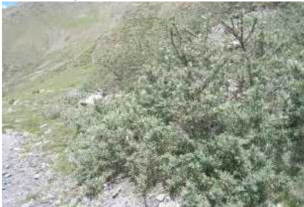
Site 4. Sea-buckthorn shrubbery ( Hippopha rhamnoides )

Site N5. GPS coordinates N42°40'21.6"/E 44°39'00.0", 1740 m a.s.l., southwest exposition. Slope inclination - 5°. This site represents the grass forbs meadow degraded from grazing. The habitat is of low conservation value. (This site located in the zone of traditional use of Kazbegi National Park, which was excluded from the Kazbegi Protected Territory before the beginning of construction of Dariali Hydropower Plant, Fig. N 1 on the Map: Cadastre Dariali Energy). The vegetation coverage is 80%, phytocenosis height – 5 cm. Below is provided species cover-abundance by Drude scale: