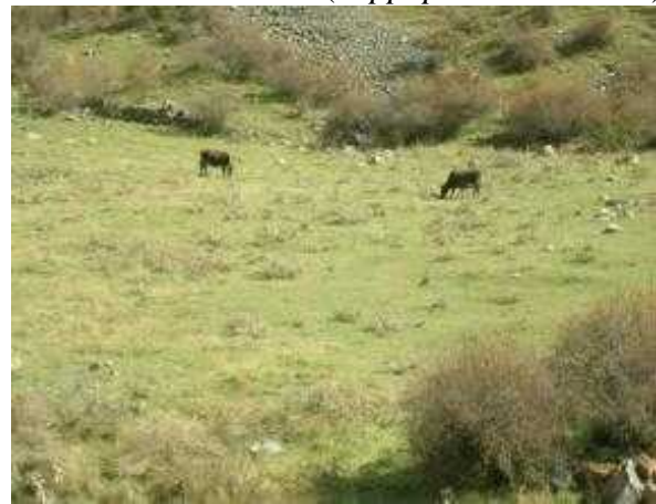
Site 3. Pasture

Site N4. GPS coordinates N42°40'29.9"/E 44°38'55.1", 1725 m a.s.l. southwest exposition. Slope inclination- 20-25°. This territory is occupied with sea-buckthorn ( Hippophae rhamnoides ) shrubbery. The coverage of vegetation is 60%. The sea-buckthorn height attains to 2 m., the herbaceous vegetation is represented by the following species: Galium album , Artemisia absinthium , Cirsium caucasicum , Urtica dioica . The habitat is of low conservation value. (This site located in the zone of traditional use of Kazbegi National Park which was excluded from the Kazbegi Protected Territory before the beginning of construction of Dariali Hydropower Plant, Fig. N 1 on the Map: Cadastre Dariali Energy).