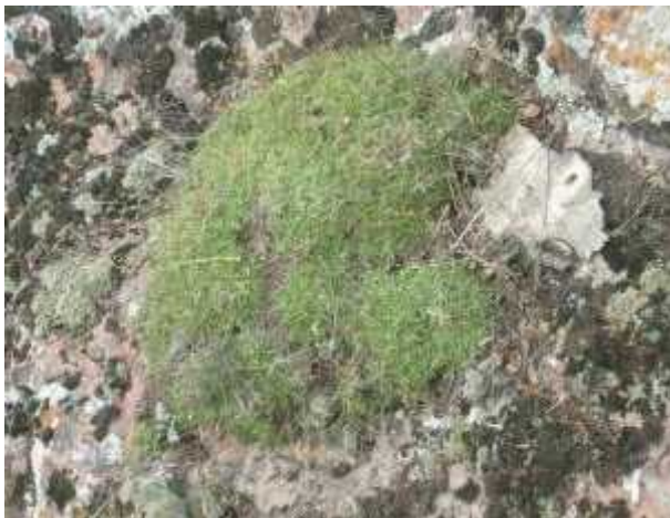
Site 15. Minuartia brotheriana