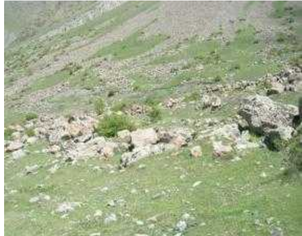
Site 11. Grass forbs meadow