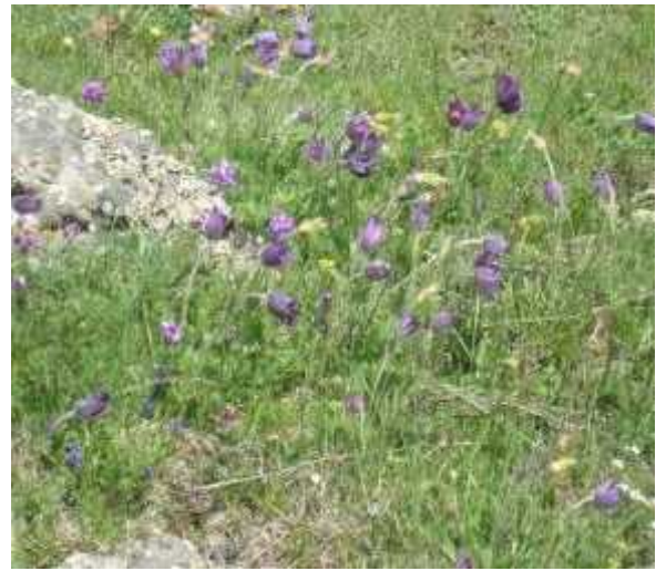
Site 12. Pulsatilla violacea aspect

Site N13. GPS coordinates N42 0 40'25.0''/E 44 0 38'53.8'', 1719 m a.s.l. The northwest exposition, Slope inclination -10-15 0 . The habitat of low conservation value. The territory is represented by sea-buckthorn shrubbery with admixed goat willow ( Salix caprea ), juniper ( Juniperus depressa ) and barberry ( Berberis vulgaris ). The sea-buckthorn height is 2.5 m, the goat willow height is 3 m, barberry height – 1.5 m, juniper – 1 m. Coverage of vegetation is 50%. (This site located in the zone of traditional use of Kazbegi National Park which was excluded from the Kazbegi Protected Territory before the beginning of construction of Dariali Hydropower Plant, Fig. N 2 on the Map: Cadastre Dariali Energy).