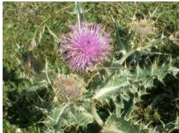
Site 2. Cirsium caucasicum