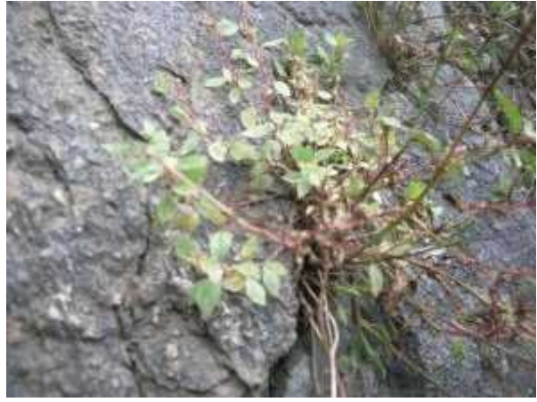
Site 19. Parietaria judaica