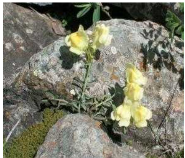
Site 12. Linaria meyeri