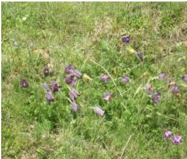
Site 12. Pulsatilla violacea aspect