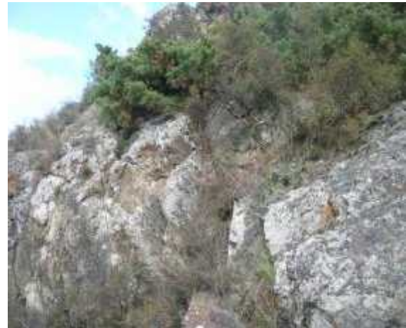
Site 15. Rock complex with Juniperus depressa