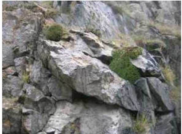
Site 19. Saxifraga juniperifolia