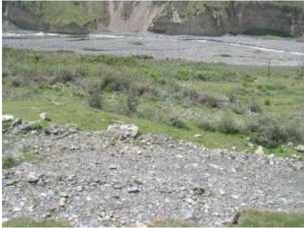
Site 4. Sea-buckthorn shrubbery ( Hippopha rhamnoides )