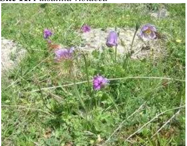
Site 11. Pulsatilla violacea