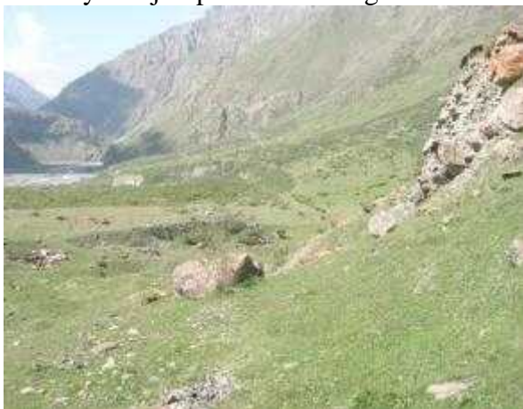
Site 5. Penstock site

Site N6. GPS coordinates N42°67'18.3''/E 44°64'80.3'', 1705 m a.s.l. Exposition – west, slope inclination -10-15°. Sea-buckthorn ( Hippopha rhamnoides ) shrubbery with admixed barberry ( Berberis vulgaris ), sweet briar ( Rosa canina ), blackberry and juniper ( Juniperus depressa ). The juniper height is 0.5 m. The habitat is of medium conservation value.