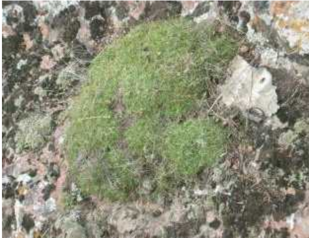
Site 15. Minuartia brotheriana