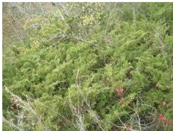
Site 10. Juniper ( Juniperus sabina )

Site N11. GPS coordinates N42°40'15.5''/E 44°39'03.7'', 1757 m a.s.l. Northwest exposition. Slope inclination-5-15°. The habitat is of medium conservation value. This site is represented with overgrazed grass forbs meadow. Coverage of vegetation-90%. Phytocenosis height – 40 cm. Below is provided species cover-abundance by Drude scale. Symbols of Drude's scale indicate frequency of occurrence/coverage of a species. (This site located in the zone of traditional use of Kazbegi National Park which was excluded from the Kazbegi Protected Territory before the beginning of construction of Dariali Hydropower Plant, Fig. N 2 on the Map: Cadastre Dariali Energy).