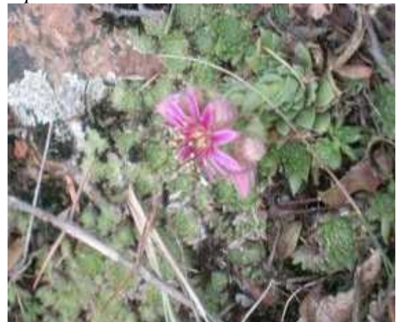
Site 15. Sempervivum caucasicum