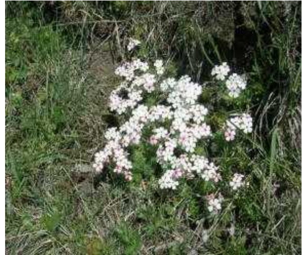
Site 12. Androsace barbulata