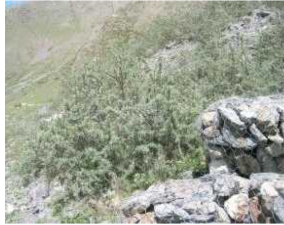
Site 4. Sea-buckthorn shrubbery ( Hippopha rhamnoides )