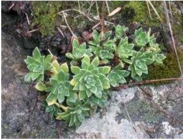
Site 20. Saxifraga cartilaginea

Site N20. Such rock-forest complexes are represented in Dariali Gorge, along the right bank of the river Tergi to Gveleti Bridge. GPS coordinates from Gveleti bridge: N42 0 70'99.8''/E 44 0 62'76.2'', 1421 m a.s.l. The habitat is of medium conservation value.