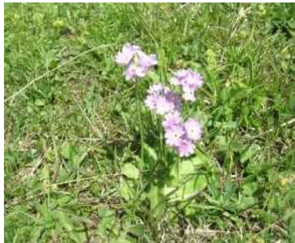
Site 11. Primula algida