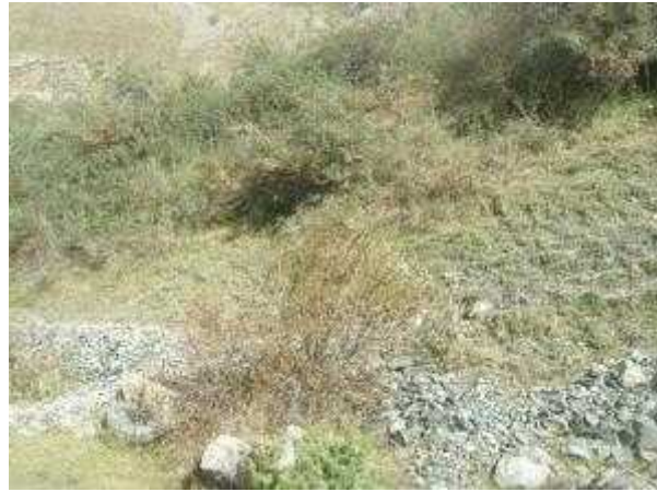
Site 7. Sea-buckthorn shrubbery ( Hippopha rhamnoides )

Site N8. GPS coordinates N42°68'04.7"/E 44°64'69.5", 1663 m a.s.l. Sparse juniper shrubbery ( Juniperus depressa ). Slope inclination - 0°. Juniper height attains to – 0.5 m. With admixed young sea-buckthorn ( Hippopha rhamnoides ) growth. The habitat is of medium conservation value. (This site is located in the zone of traditional use of Kazbegi National Park which was excluded from the Kazbegi Protected Territory before the beginning of construction of Dariali Hydropower Plant, Fig. N 2 on the Map: Cadastre Dariali Energy).