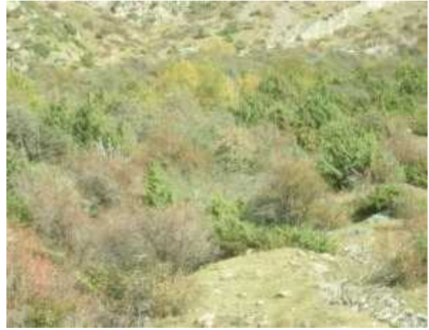
Site 8. Juniper shrubbery ( Juniperus depressa )

Site N9. GPS coordinates N42°68'16.6"/E 44°64'68.4", 1662 m a.s.l. Sea-buckthorn shrubbery with admixed goat willow. Exposition – northwest. Slope inclination -5°. Sea-buckthorn height – 2.5m, goat willow height -4-5m. Isolated species of birch ( Betula litwinowii ) with the height 5m. On the adjacent bank Cirsium sp., Artemisia absinthium , Echinops sphaerocephalus are growing. The habitat is of medium conservation value. (This site located in the zone of traditional use of Kazbegi National Park which was excluded from the Kazbegi Protected Territory before the beginning of construction of Dariali Hydropower Plant, Fig. N 2 on the Map: Cadastre Dariali Energy).