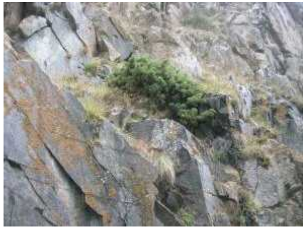
Site 19. Juniperus depressa