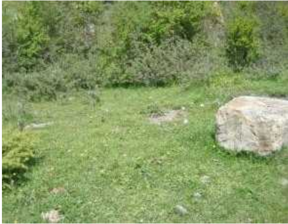
Site 5. Overgrazed grass forbs degraded meadow with the sea-buckthorn shrubbery in the background