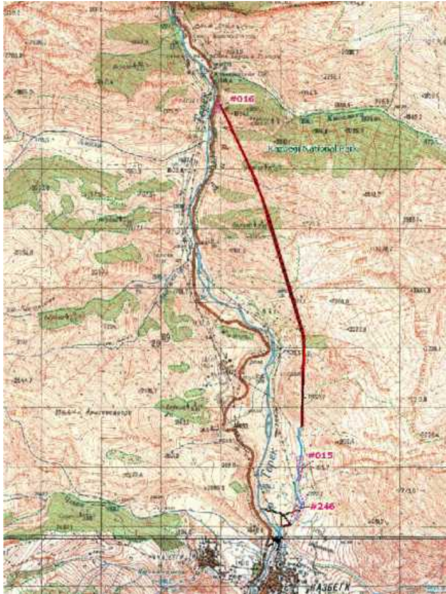
Map 1. The scheme of the Dariali HPP Project

Dark red line – diversion tunnels, Light blue line – diversion pipeline, Black polygon – headwork's, Brown polygon – sedimentation basin, Orange line-flushing gallery and water spillway channel, Magenta hatched polygon – sites extracted from NP (#015, #016, #246), Green dashed line – border of the Kazbegi National park.