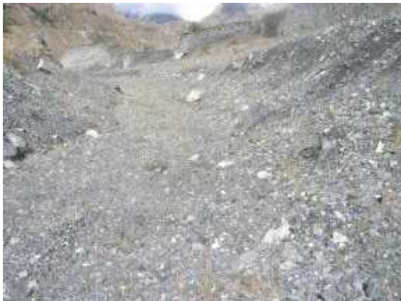
Site 1. Erosive relief

Site N1. GPS coordinates N42°66'72.3''/E 44°64'54.7'', 1725 m a.s.l. Exposition northwest, slope inclination 5-35°. The right bank of the river Kurostskali at its inflow into the river Tergi. The designed place for construction of watershed facilities. Weathered detritus, erosive relief. The following species of plants are growing sparsely: Oxytropis cyanea , Cerastium sp., Festuca varia , Moehringia trinervia , Pyrethrum sp., Tussilago farfara , Taraxacum officinale , Trifolium spadiceum , Artemisia absinthium , Senecio sosnovskyi . Sparse are sea-buckthorn ( Hippophae rhamnoides ) species. The habitat of low conservation value. (This site was located in the zone of traditional use of Kazbegi National Park, which was excluded from the Kazbegi Protected Territory before the beginning of construction of Dariali Hydropower Plant, Fig. N 1 on the Map: Cadastre Dariali Energy).