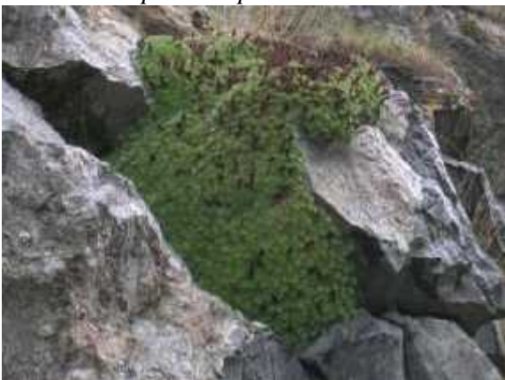
Site 19. Saxifraga juniperifolia