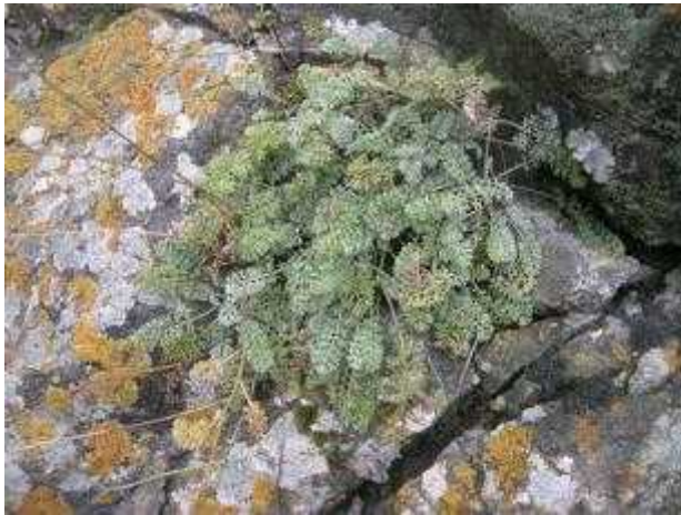
Site 20. Anthemis marschalliana subsp. marschalliana