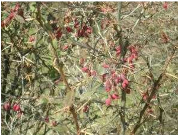
Site 3. Berberis vulgaris