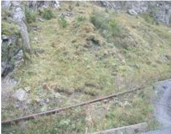
Site 18. Grass forbs meadow Festucetum-mixtoherbosa

Potentilla cranzii- Sp 3 Galium verum- Sp 3 Thymus sp.- Sp 2 Coronilla varia- Sp 2 Achillea millefolium- Sp 2 Artemisia absinthium-Sp 1 Salvia verticillata- Sp 1 Hypericum perforatum- Sp 2 Thalictrum alpinum-Sol Plantago lanceolata-Sol Echium vulgare-Sol