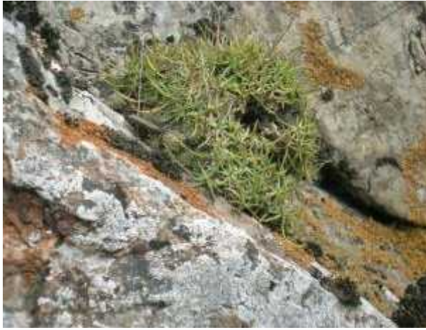
Site 15. Limewort