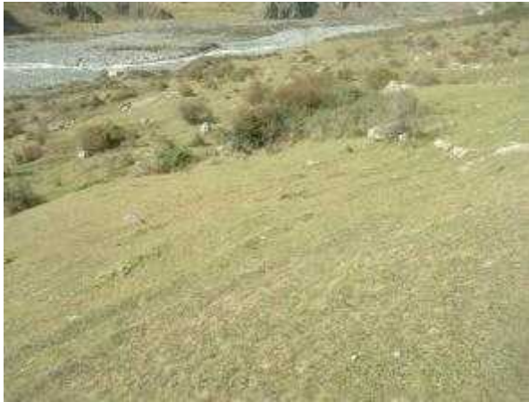
Site 7. Sea-buckthorn scrubberies in degraded grass forb meadow

Site N7. GPS coordinates N42°67'78.9"/E 44°64'75.0", 1674 m a.s.l. Exposition – west. Slope inclination - 20-25°. In the degraded grass forbs meadow the sea-buckthorn scrub is growing in kind of islets (like the previous site). The habitat is of medium conservation value.