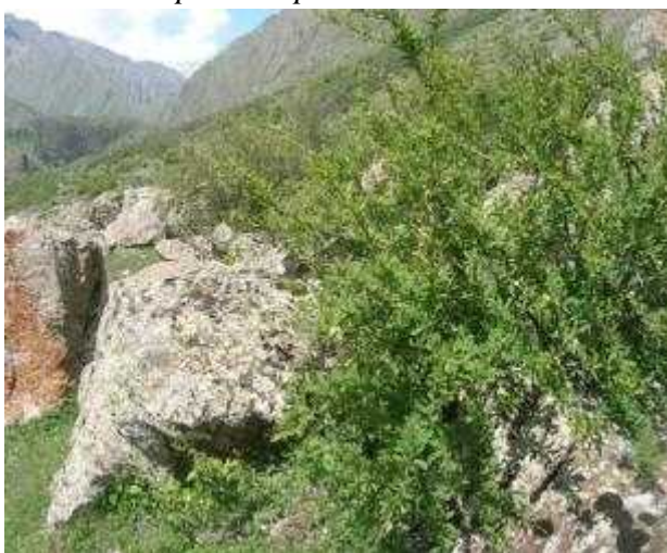
Site 12. Berberis vulgaris