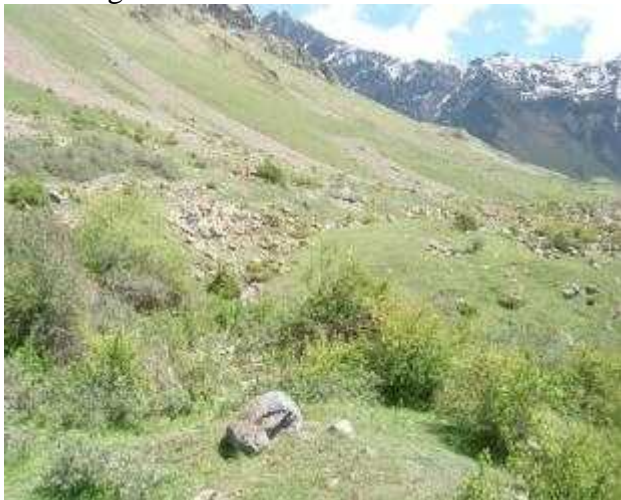
Site 5. Overgrazed grass forbs degraded meadow with the shrubbery of sea-buckthorn, barberry and juniper in the foreground