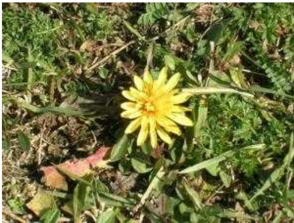
Site 2. Taraxacum officinale

Alchemilla sp.-Cop 3 Carum carvi- Cop 2 Trifolium ambiguum- Cop 1 Taraxacum officinale-Sp 3 Plantago lanceolata- Sp 2 Agrostis planifolia- Sp 2 Minuartia sp.- Sp 1 Cirsium caucasicum-Sol Juniperus depressa-Unic