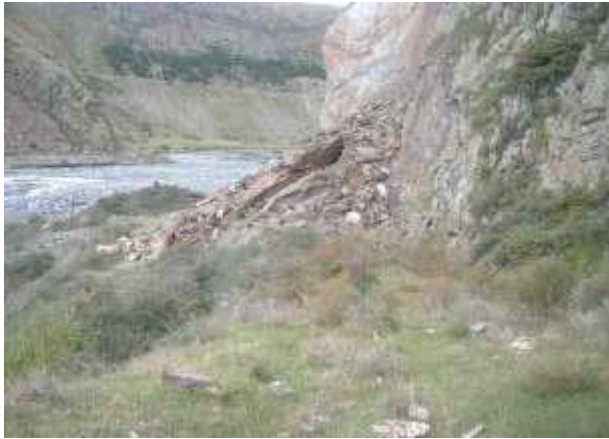
Site 17. “Rock legs”