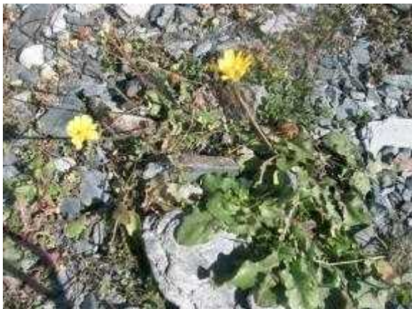
Site 1. Taraxacum officinale