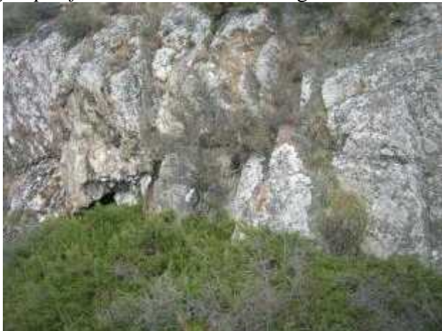
Site 15. Rock complex with Juniperus sabina

Site N15. GPS coordinates N42 0 68'45.9''/E 44 0 64'47.2'', 1612 m a.s.l. Exposition – southwest. Slope inclination - 70-80 0 . Rock complex. Juniperus sabina , Juniperus depressa , with admixed Spiraea hypericifolia . Herbaceous plants are represented by: Minuartia brotheriana , Saxifraga cartilaginea , Sedum caucasicum , Sempervivum caucasicum , Asplenium septentrionale , Saxifraga juniperifolia . The habitat is of high conservation value.