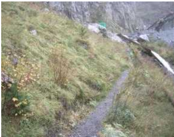
Site 18. Grass forbs meadow Festucetum-mixtoherbosa