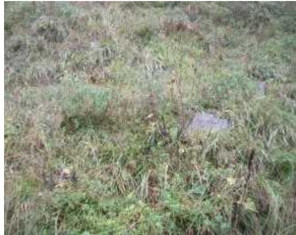
Site 18. Grass forbs meadow Festucetum-mixtoherbosa