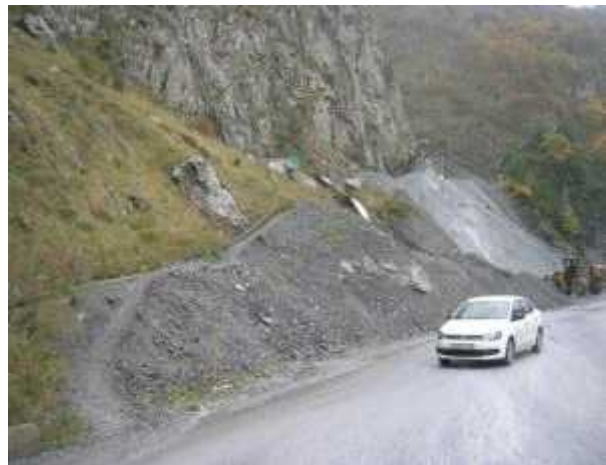
Site 18. Dariali. Tunnel portal vicinity

Site N19. Dariali. Rock complex. The same place. Rock inclination – 70-90°C. Exposition – west. Pine ( Pinus kochiana ), juniper ( Juniperus depressa ) sparsely grow on the rock. From herbaceous plants are represented the following species: Parietaria judaica , Anthemis marschalliana subsp. marschalliana , Saxifraga cartilaginea , Saxifraga juniperifolia , Asplenium septentrionale . The habitat is of medium conservation value. (This site located in the zone of traditional use of Kazbegi National Park which was excluded from the Kazbegi Protected Territory before the beginning of construction of Dariali Hydropower Plant, Fig. N 3 on the Map: Cadastre Dariali Energy).