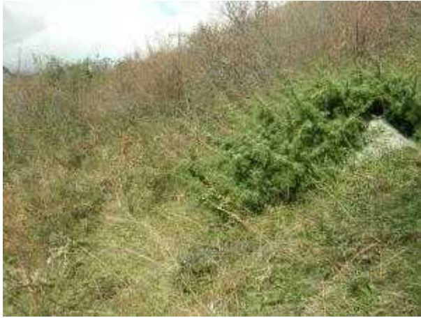
Site 6. Juniper ( Juniperus depressa )