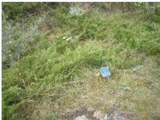
Site 10. Juniper ( Juniperus sabina )

Site N10. GPS coordinates N42°68'42.4''/E 44°64'46.7'', 1621m a.s.l. Juniper shrubbery ( Juniperus sabina ). Exposition - southwest, slope 10-15°. Juniper height from 40-50 cm to -1 meter. With admix sweet briar ( Rosa canina ), sea-buckthorn ( Hippopha rhamnoides ), rock-red currant ( Ribes biebersteinii ). The habitat is of medium conservation value. (This site located in the zone of traditional use of Kazbegi National Park which was excluded from the Kazbegi Protected Territory before the beginning of construction of Dariali Hydropower Plant, Fig. N 2 on the Map: Cadastre Dariali Energy).