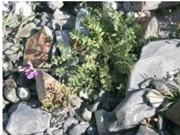
Site 1. Oxytropis cyanea