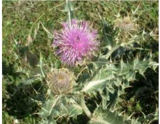
Site 2. Cirsium caucasicum