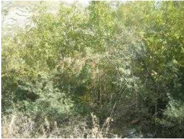
Site 9. Sea-buckthorn shrubbery with admixed goat willow and birch

Site N9. GPS coordinates N42°68'16.6"/E 44°64'68.4", 1662 m a.s.l. Sea-buckthorn shrubbery with admixed goat willow. Exposition – northwest. Slope inclination -5°. Sea-buckthorn height – 2.5m, goat willow height -4-5m. Isolated species of birch ( Betula litwinowii ) with the height 5m. On the adjacent bank Cirsium sp., Artemisia absinthium , Echinops sphaerocephalus are growing. The habitat is of medium conservation value. (This site located in the zone of traditional use of Kazbegi National Park which was excluded from the Kazbegi Protected Territory before the beginning of construction of Dariali Hydropower Plant, Fig. N 2 on the Map: Cadastre Dariali Energy).