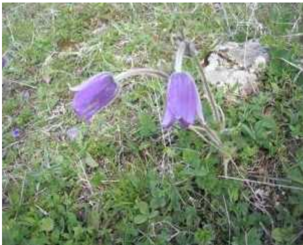
Site 11. Pulsatilla violacea