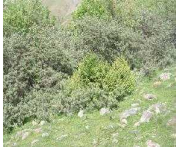
Site 13. Sea-buckthorn shrubbery with admixed goat willow, juniper and barberry