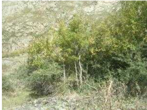
Site 9. Sea-buckthorn shrubbery with admixed goat willow and birch