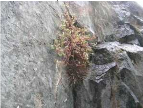
Site 19. Parietaria judaica