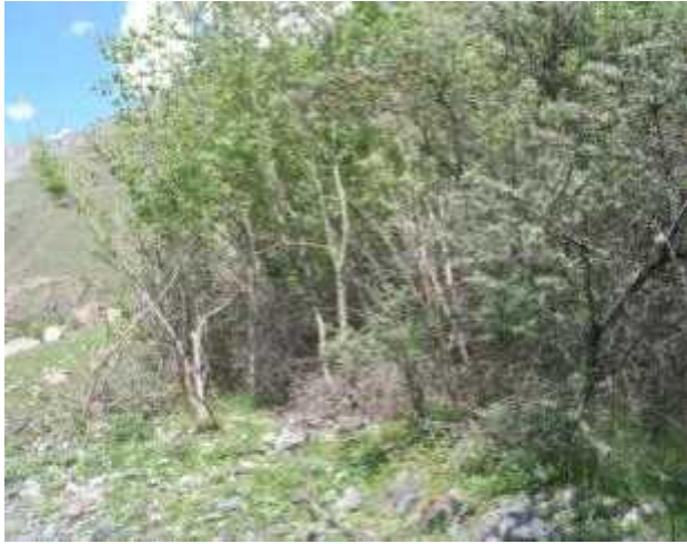
Site 13. Sea-buckthorn shrubbery with admixed goat willow, juniper and barberry