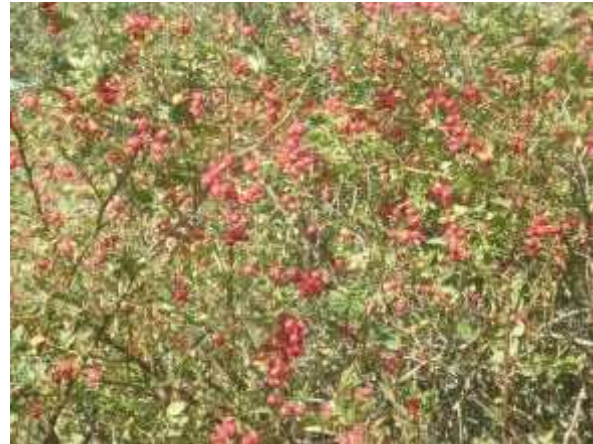
Site 3. Rosa canina