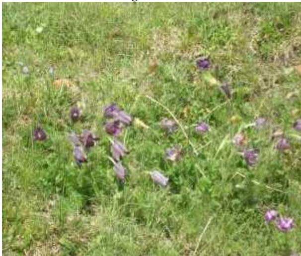
Site 12. Pulsatilla violacea aspect