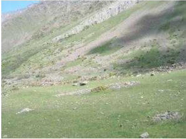
Site 11. Grass forbs meadow

The site is represented by the sparse shrubbery among the stones with the following species: barberry ( Berberis vulgaris ), juniper ( Juniperus depressa ), Asplenium trichomanes , Thalictrum buschianum .