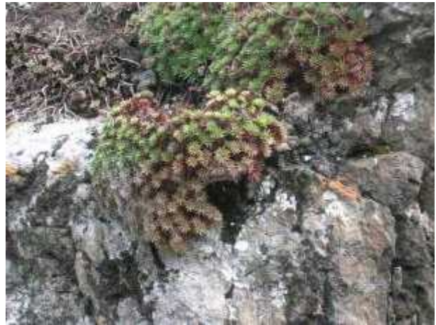
Site 15. Saxifraga juniperifolia