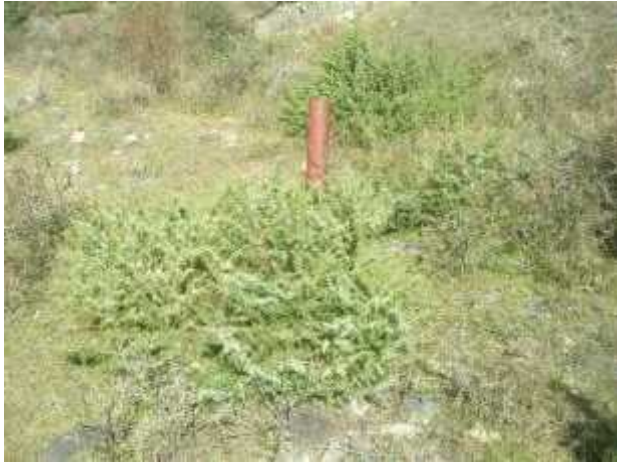
Site 8. Juniper shrubbery ( Juniperus depressa )