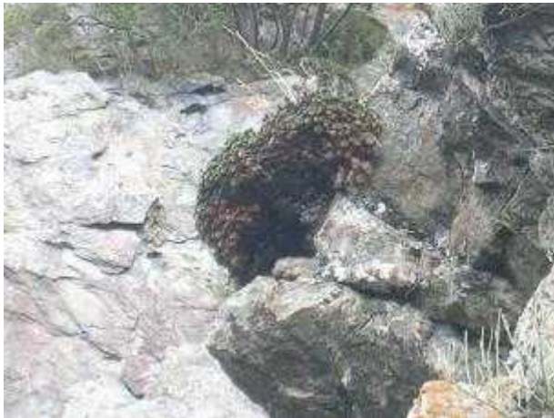
Site 17. Saxifraga juniperifolia

Site N18. GPS coordinates N42 0 72'88.0''/E 44 0 62'93.1'', 1400 m a.s.l. Exposition – west, slope inclination-30-35 0 . The height of herblayer is -40 cm. The grass forbs meadow Festucetum-mixtoherbosa. The habitat is of low conservation value. (This site located in the zone of traditional use of Kazbegi National Park, which was excluded from the Kazbegi Protected Territory before the beginning of construction of Dariali Hydropower Plant, Fig. N 2 on the Map: Cadastre Dariali Energy).