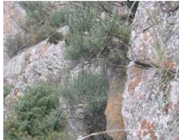
Site 17. Ephedra procera