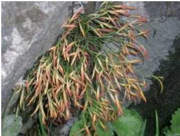
Site 20. Asplenium septentrionale

Site 21. Kazbegi District, southeast exposition. Slope inclination - 15°, inclined relief, undulating subrelief.