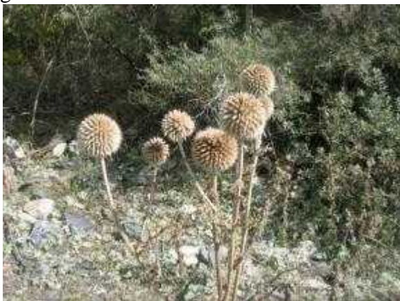
Site 9. Echinops sphaerocephalus