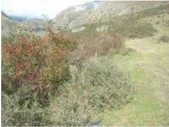
Site 3. Degraded pasture with scrubs