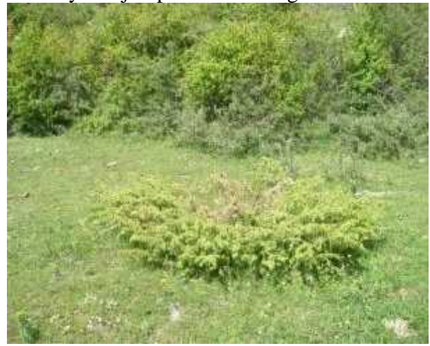
Site 5. Juniper Juniperus depressa