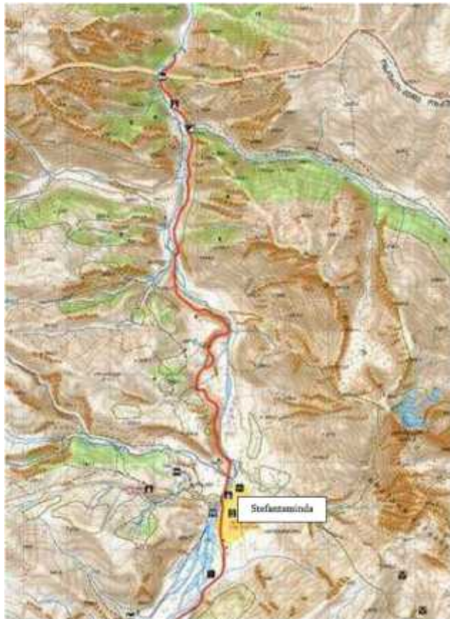
Figure 2. Map of the Project Construction Region

The Project is considered Category A under the EBRD respective policies. The Project includes the Dariali HPP and its associated infrastructure and corporate structures. The Study Area for this BAP is the Project site and the terrestrial Project's Area of Influence (the aquatic aspects are subject to another report).