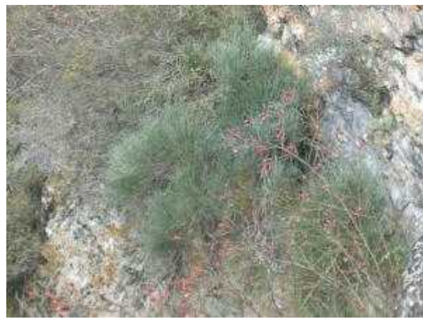
Site 16. Ephedra procera

Site N17. GPS coordinates N42°68'57.4''/E 44°64'34.1'', 1585m a.s.l. On the rock (slope inclination - 80-90°) are developed juniper shrubbery with admixed meadowsweet - Spiraea hypericifolia , Ephedra procera . Below, on the right bank terrace of the river are developed sea-buckthorn shrubbery. Iberian Aster ( Aster ibericus ) flowers in autumn. The habitat is of medium conservation value.