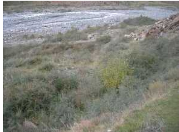
Site 17. Sea-buckthorn shrubbery