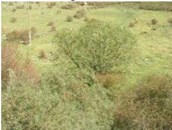
Site 3. Goat willow ( Salix caprea )