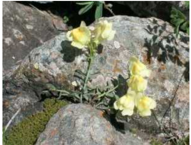
Site 12. Linaria meyeri