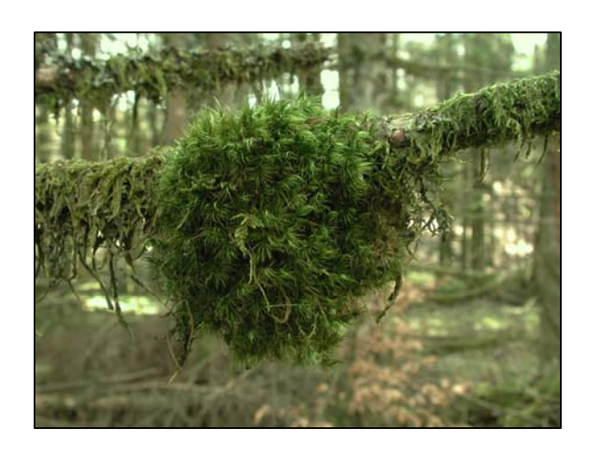
Fig. 1. Dicranm scoparium

The same changes (invasion of species from the south and west) are also found amongst the lichens in Central Europe. A major point of criticism is that all these species were simply overlooked. That can be the case in one or the other species. But 40 species cannot have been overlooked and some of the new records concern famous spots of bryological interest, which were frequently visited over the time.