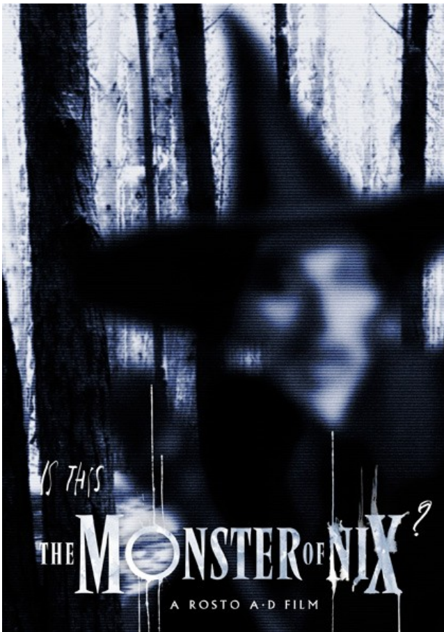
THE CURSING WITCH