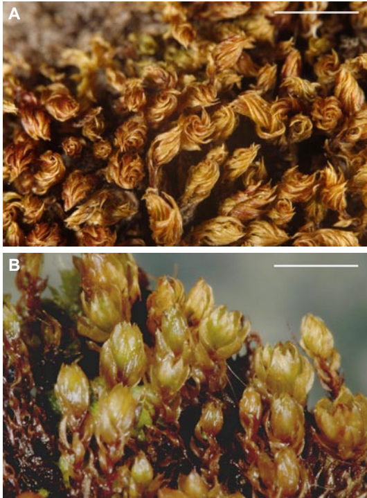
Fig. 1. Habit of Bryum minii Podp. ex Machado-Guim. growing in a typical mat, showing dry plants with spirally twisted leaves (A) and hydrated plants (B). Scale bars: A & B = 4 mm.

Baixa, Douro Litoral, Minho and Trás-os-Montes e Alto Douro (Guerra et al. 2010), although in this last province no specific locality is given.