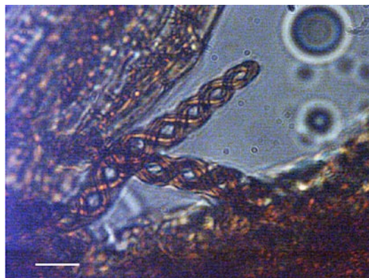
Fig. 3. Photograph of elaters of Cephalozia macounii (Aust.) Aust. Scale bar = 10 \mu\text{m} .

hazards in the germination phase, which reduces the reproductive benefit of easily dispersed spores. Most likely, however, the infrequency of spore production is more important in determining the rarity of C. macounii than dispersal ability as such.