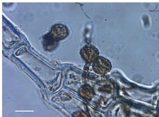
Fig. 2. Photograph of spores of Cephalozia macounii (Aust.) Aust. Scale bar = 10 \mu\text{m} .

The spores of C. macounii are globular, (red-dish) brown, with a slightly verrucose surface, and diameter of ca 10 \mu\text{m} , ranging from 8 to 11 \mu\text{m} (Fig. 2). The elaters are laxly bi-spiral, 8–11 \mu\text{m} wide and 60 \mu\text{m} long (Fig. 3). The small size of the spores is often considered an advantage in long-distance dispersal (e.g., van Zanten & Pocs 1981). On the other hand, small spores may face